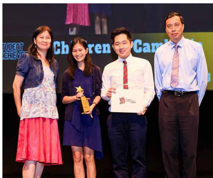
Children of Cambodia committee members receiving the Gold Award in Projects (Community Service) category.

The Projects (New Initiatives) category is a newly added category, and Project Inspire, an initiative by the Medical Society, was one of the awardees. The Medical Society publication directorate successfully published 'Hearfelt' that provided a platform for established doctors to share their valuable experiences with patients. The project is also a product of the students' continuous effort to support the Christine Chong Hui Xian Bursary.